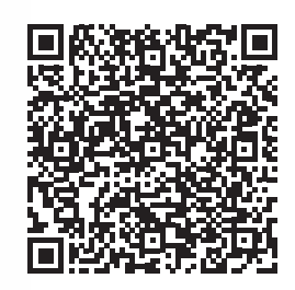
Scan with your smartphone camera for a list of seminars.

Our hours are 8 a.m. - 8 p.m. seven days a week from October 1 - March 31. From April 1 - September 30, Monday — Friday, our hours are 8 a.m. - 8 p.m. A voice messaging service is used weekends, after-hours, and federal holidays. Calls will be returned within one business day.